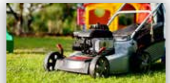
Home & Yard Maintenance